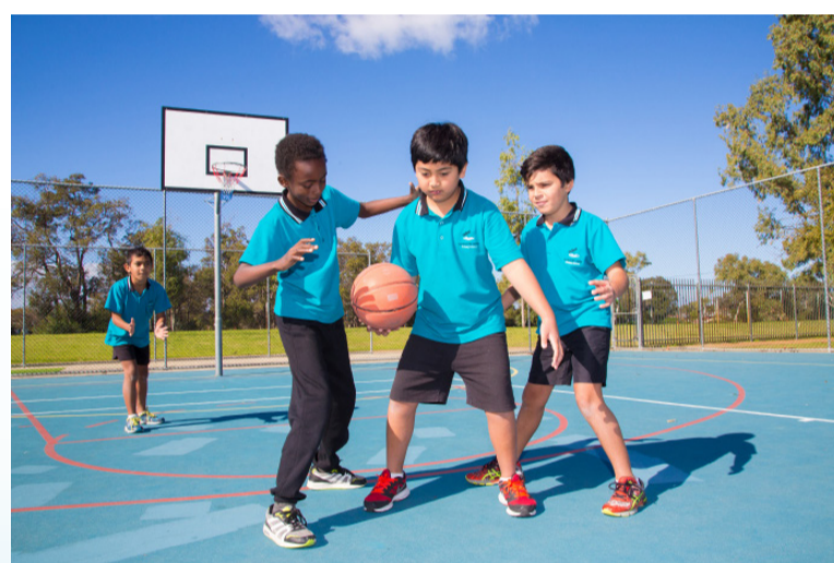
"Trying my hardest and pushing myself to be my best"