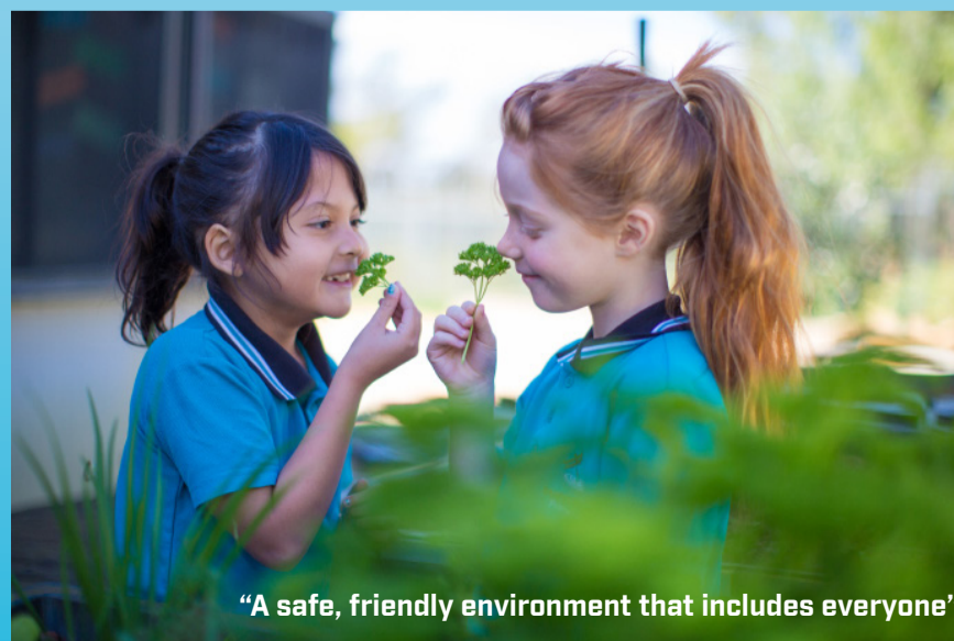
"A safe, friendly environment that includes everyone"